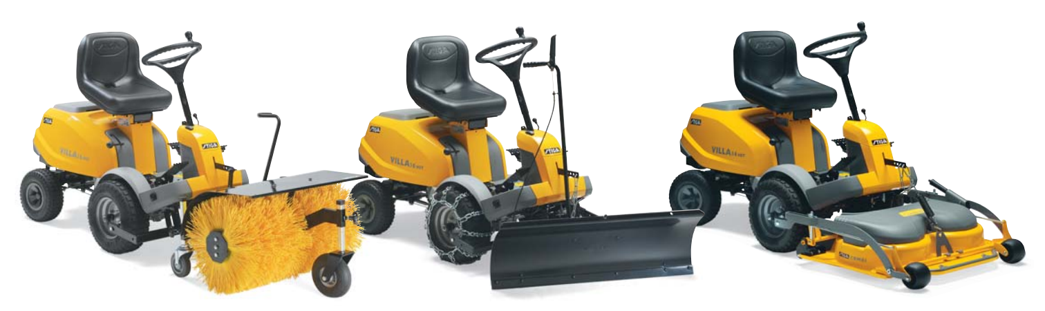
Villa with sweeper

The Villa range is the year round companion for home owners. If you want to get the most out of it: Get equipped for year round use and spread the cost over the year. For the full range of implements – see page 12!